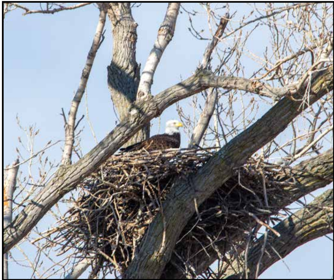
This one is perched with its mate on page 4.