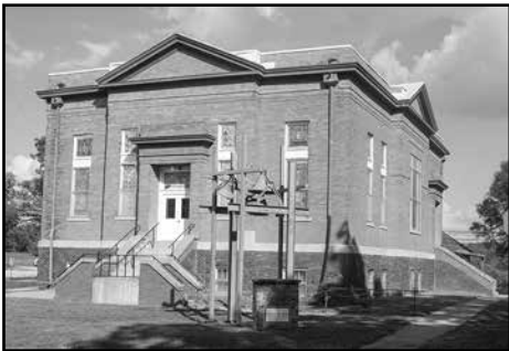
Peru Community Church 520 Nebraska Street Pastors Raymond & Rebecca Girard Services - Sunday 10:45 am