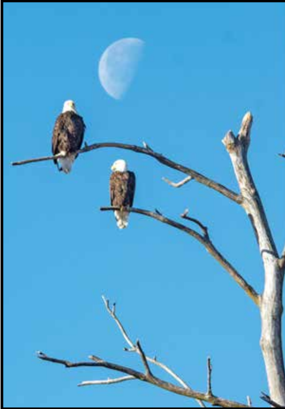
Eagles & Daytime Moon, 01/24/2022

Auburn • Brownville • Cook • Falls City • Johnson • Nebraska City • Nemaha • Peru • Rock Port • Syracuse • Tecumseh • Verdon