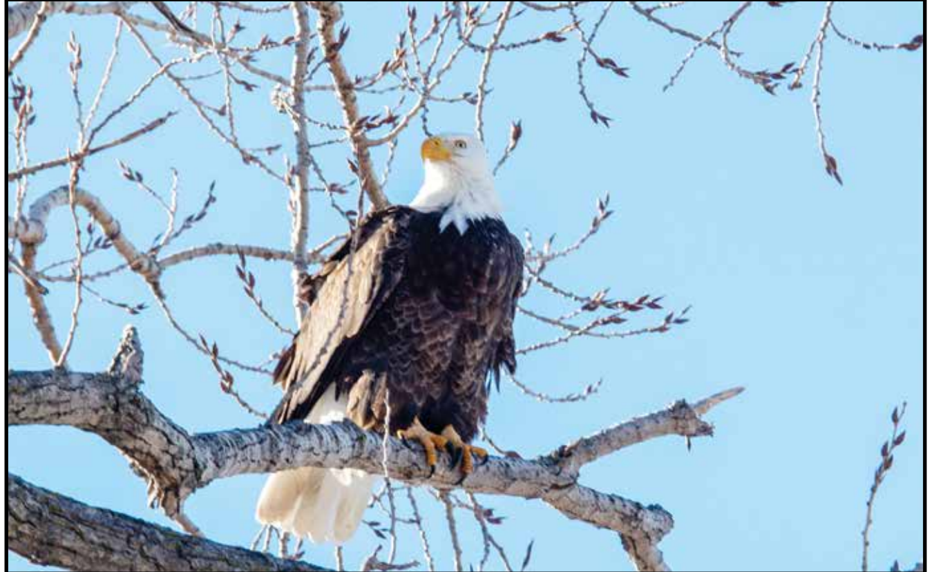
American Bald Eagle 01/24/2022, Loess Bluffs National Wildlife Refuge

Sweeten your Coffee Break with Views and Voices from the Valleys of the Nemaha.