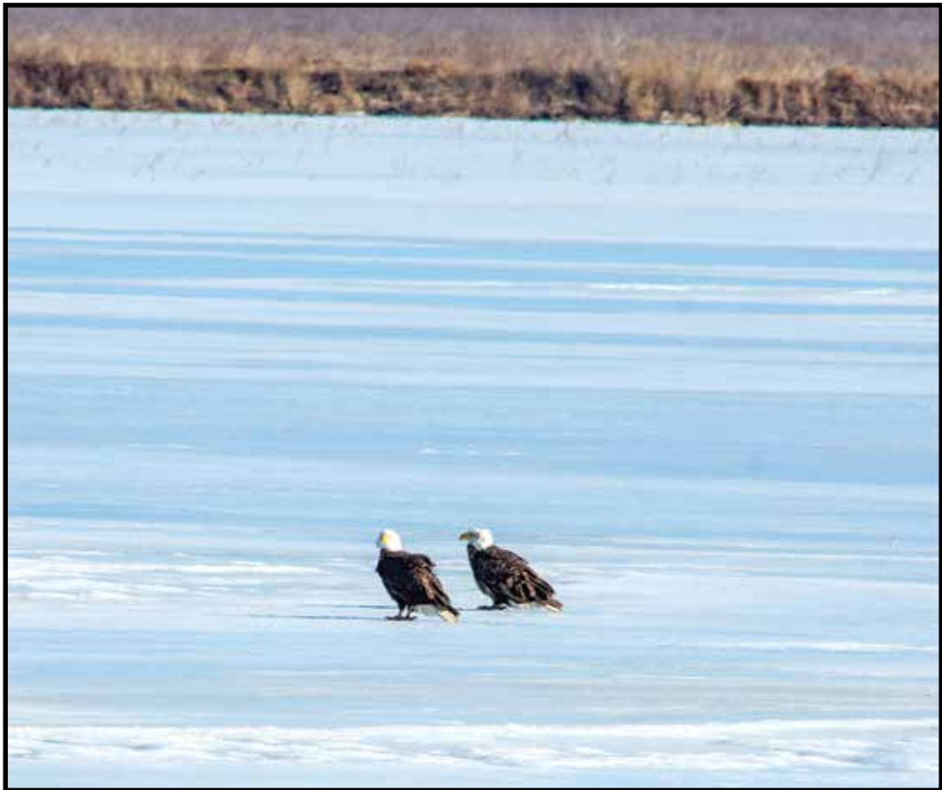
Are they ice-fishing??