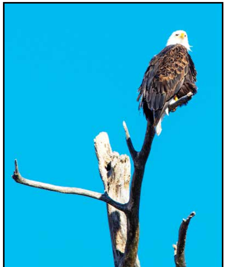
It's mate flew to their nest... see page 15.