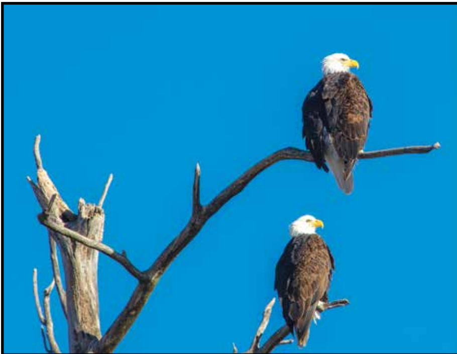
Above and below; Bald Eagle pair not far from their nest. Loess Bluffs National Wildlife Refuge, 01/24/2022.

Find Your Country Neighbor in fine businesses in the cities listed beneath the banner on page 1.