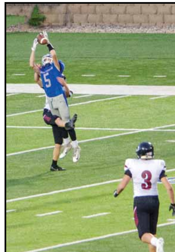
Lourdes reception set up first TD against BDS, Bruning, Nebraska