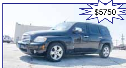
2007 HHR LT 2.2 L