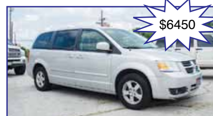
2008 Dodge Grand Caravan SXT