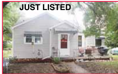
1202 14th Street $68,000 2-bed, 1 1/2 bath, new roof, windows, siding, 1-car attch. garage.