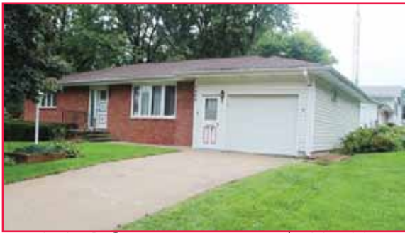
2404 L Street $129,500

Very well maintained home. Two bedrooms, 1.5 bath. Eat-in kitchen is spacious, with tons of cabinet space. Generously sized living room! Full basement is partially finished with family room, non-conforming bedroom, and HUGE storage area. One car attached garage with ramp into house. Large mud room could easily be modified to main floor laundry space. Garden shed. Lot is large enough to add a two car detached garage. Come check this one out!!