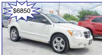
2008 Dodge Caliber R/T