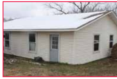
72791 638 Ave. $75,000 10.47+/- acres 1/4 mile from town. Workshop, barn. Older home needs attention or removed. Terrific buiding location.