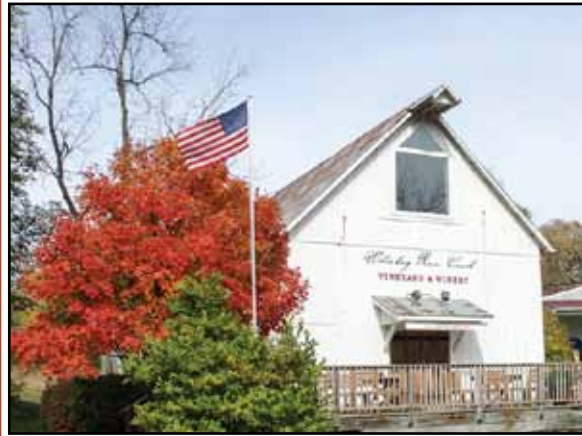
Whiskey Run Creek Winery