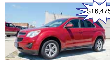
2013 Chevy Equinox LT