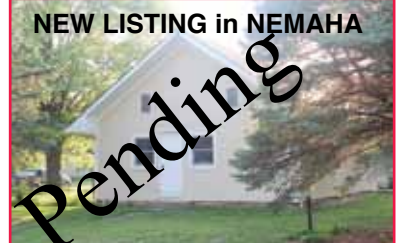
315 3rd Street $38,500 2 bed, 1.5 bath, 2-car garage in basement, 1-car detached.