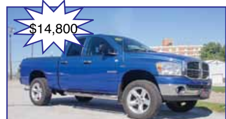
2008 Dodge Ram 1500 SLP