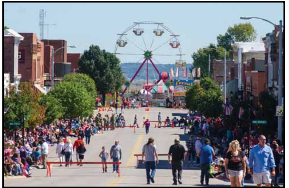
I am told this is a very impressive scene at night... I'll try next year.