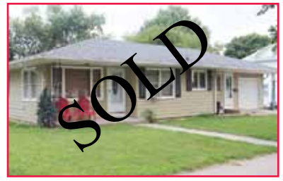
1112 N Street $78,000 2 bed, 1 3/4 bath, furnished! Spacious yard, attached garage.