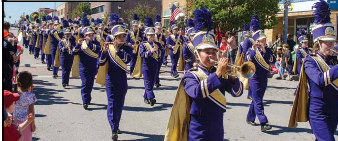
The Nebraska City Pioneers High School Marching Band , AppleJack Parade, Sept. 2018