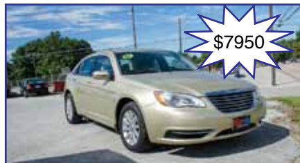
2011 Chrysler 200 Touring