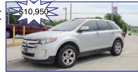
2011 Ford Edge AWD