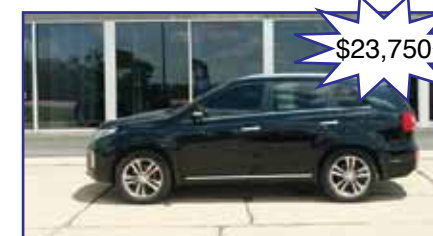
2015 Kia Sorento SX Limited