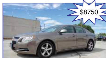
2011 Chevrolet Malibu LT