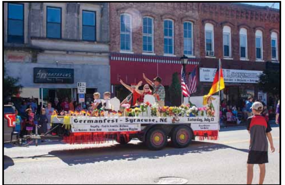
The Syracuse Germanfest float is a 'regular'.