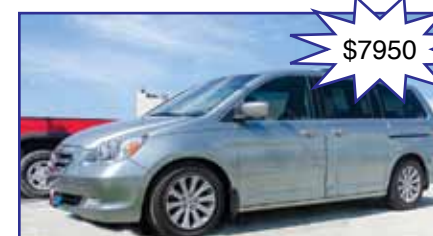
2007 Honda Odyssey