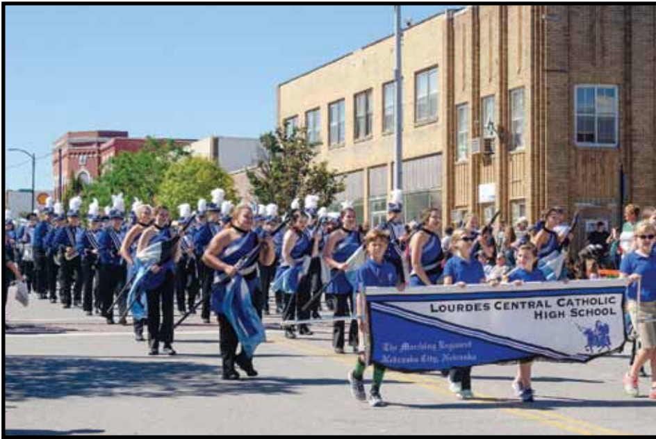
Lourdes Central Catholic High School Marching Band