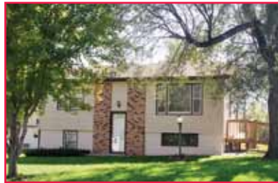
1907 26th Street $125,000 Nice 4 bed, 2 bath home has been freshly painted. Huge family room, HVAC new in 2016. Large lot on edge of town.