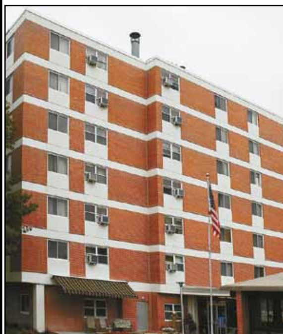
Valley View Apartments (High Rise) • 1017 H Street • Auburn, NE