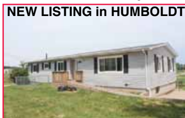
990 Nemaha Street $40,000 3 bed, 1 bath, newer furnace, 2-car heatd garage.