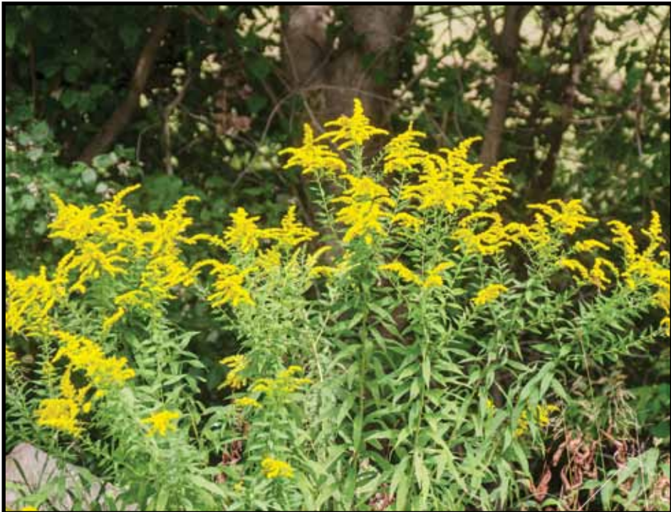
A variety of Goldenrod