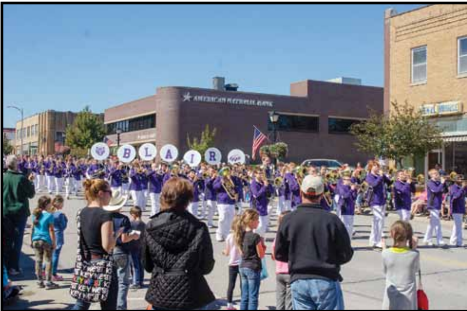
Blair always brings impressive sounds.