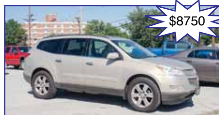
2006 Chev Traverse LTZ