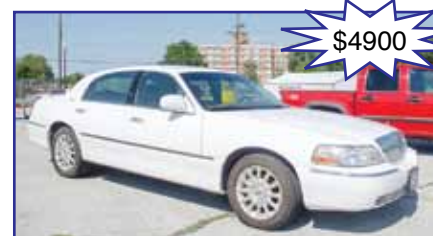
2007 Lincoln Signature Towncar